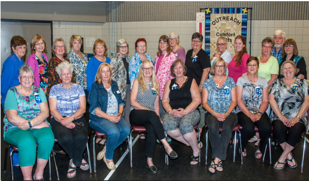
Halton Quilters Guild Executive 2017—2018