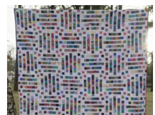
DOTS AND DASHES